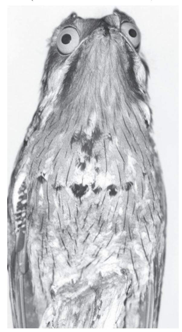
Fun Fact: The potoo always looks like this, or often even sillier.

ConvolutED("Reverse centaur: front half horse, back human").