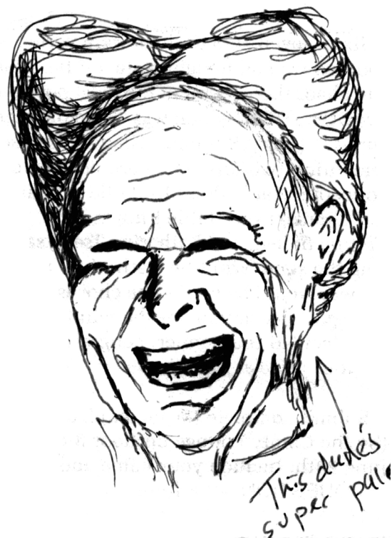
Gary Oldman as Vlad Dracula