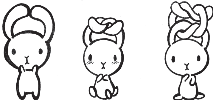
fig. Topological buns.