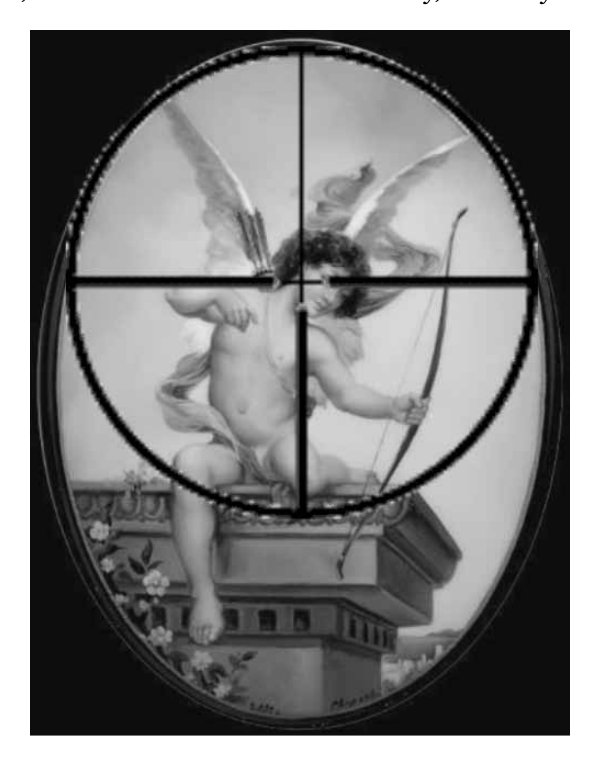
The Valentine's Day Massacre