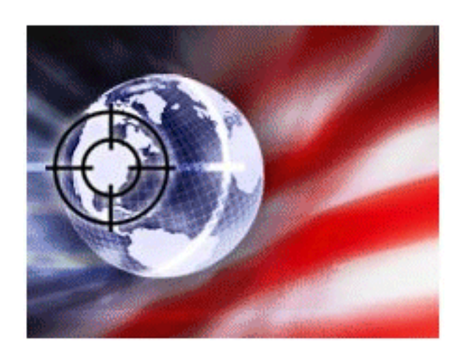
February 7th, 2003, 3:17 PM

CNN highly regrets the error, and apologises to the igloo, snow, and ice owners in Manitoba and Nunavut for unsubstantiated alarm. CNN will take greater precautions to ensure such incidents do not occur again.