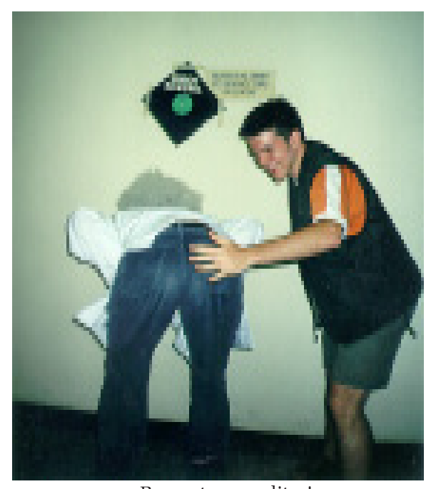
Respect your editor!